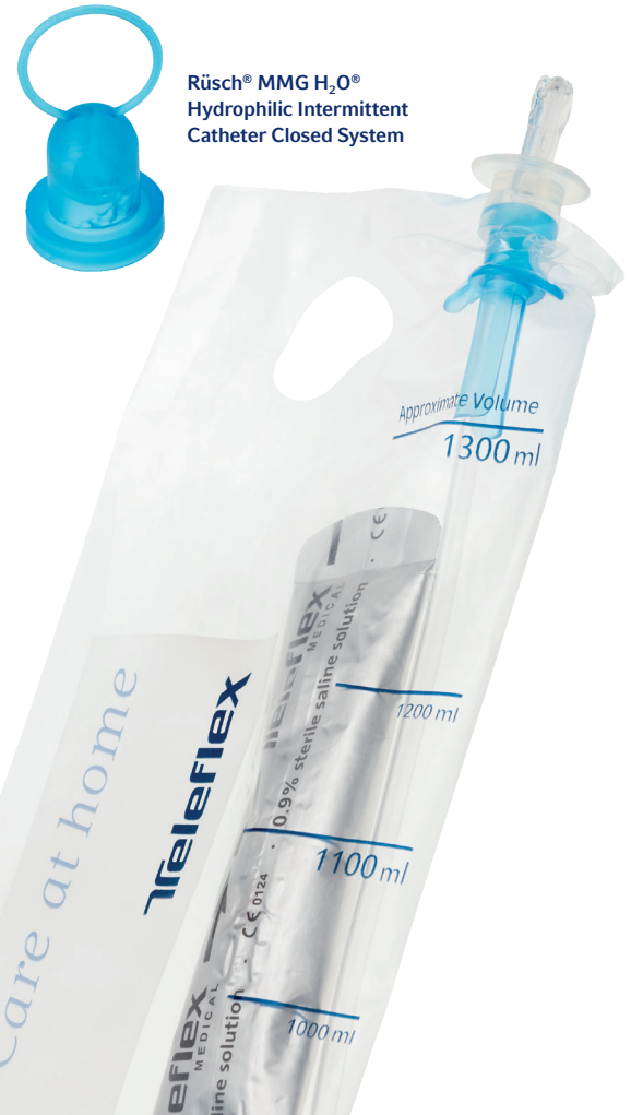
Rüsç® MMG H 2 O® Hydrophilic Intermittent Catheter Closed System

*Kits contain sterile gloves (not made with natural rubber latex), underpad, antiseptic skin prep, gauze and refuse bag for convenient disposal