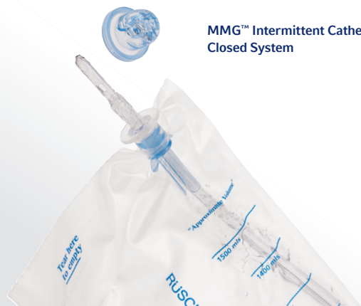
MMG™ Intermittent Catheter Closed System