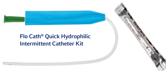
Flo Cath® Quick Hydrophilic Intermittent Catheter Kit